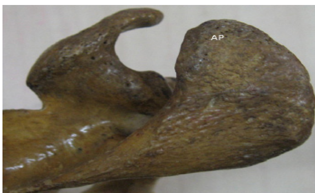
Figure 3. Triangular shape of acromion process, AP= acromion process.