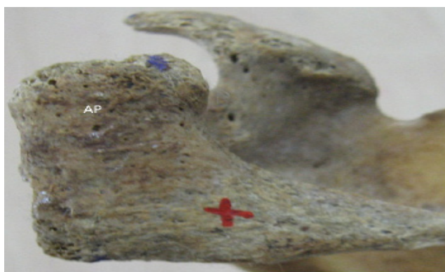
Figure 4. Quadriangular shape of acromion process, AP= acromion process.