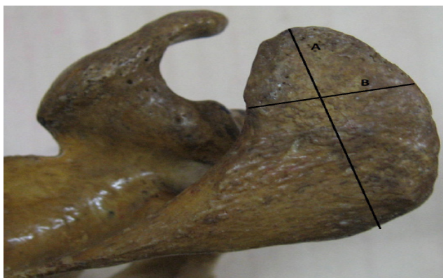
Figure 1. Length (A) and Breadth (B) of acromion process.