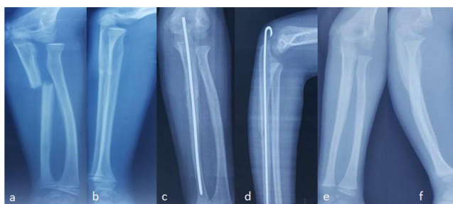
Figure 2. Bado type 3 Monteggia fracture dislocation a,b: Pre operative AP and Lateral view. c,d: Post operative AP and lateral view with Rush pin in situ. e,f: Ap and lateral view after rush pin removal