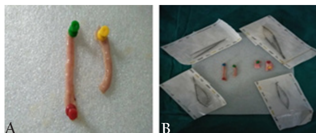
Figure 4. (A) parts of chicken intestine to practice vascular anastomosis, (B) parts of chicken intestine and aorta of a goat along with surgical instruments (fine forcep, crestro needle holder, potts scissors) needed to practice vascular anastomosis