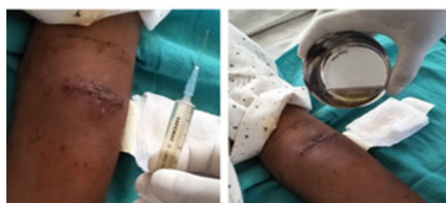
Figure 3. Lymphocele formation following creation of left brachiocephalic arteriovenous fistula

AVF, arteriovenous fistula; N, number; RC, radiocephalic; BC, brachiocephalic; BB, brachio basilic; Lt, left; Rt, right