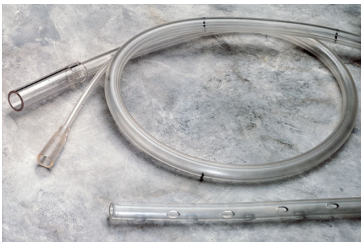
Figure 3. Lavacuator

Gastric lavage is a lifesaving procedure, but it is associated with significant risks, hence it should always be performed by trained personnel, under supervision and only when indicated. In this case the procedure was done by an unqualified, unskilled person, which led to death of the patient. A case was initially booked as that of unnatural death. Based on the autopsy findings, histopathology report the final opinion as to the cause of death was given as "peritonitis consequent upon perforation of lesser curvature of stomach". The police on the basis of the above report later converted the case into one of medical negligence, and booked it under Sec 304(A) IPC.