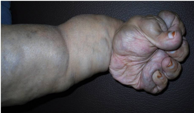
Figure 3. Severe restriction of flexion and poor grip due to excess soft tissue in the palm.