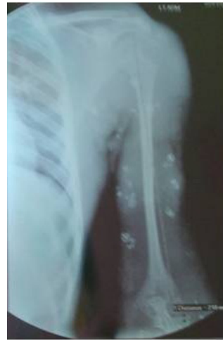
Figure 4. Multiple well-defined radio-radio-opaque lesions in arm consistent with phleboliths