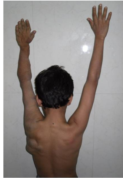
Figure 2. Overall shortening of the limb.