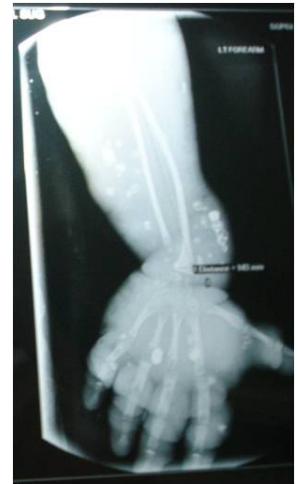
Figure 5. Multiple radio-opaque lesions in forearm and hand consistent with phleboliths.