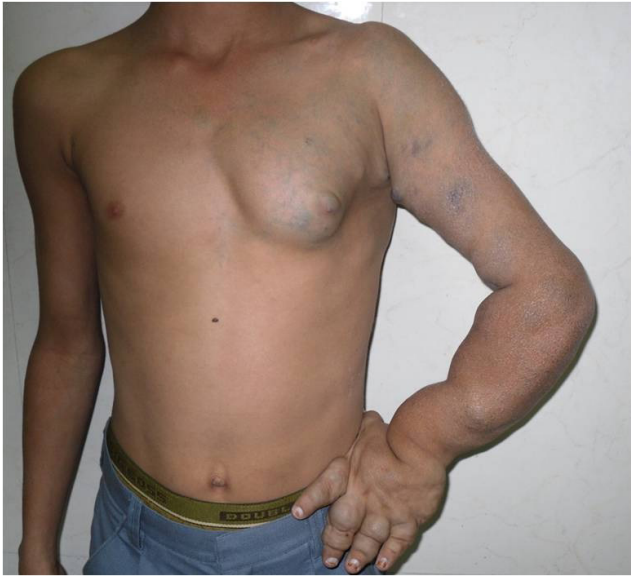
Figure 1. Upper limb has multiple separate swollen areas over the whole of the arm and shoulder girdle.