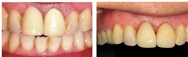
Figure 12. Insertion of provisional crown with respect to #11 and #21