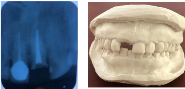
Figure 2. Radiograph showing root canal filling Figure 3. Cast fabricated

Crown lengthening was recommended after consulting with the restorative dentist to increase the length of the clinical crown. Alginate impressions of the upper and lower arch were made and were immediately poured with plaster of paris for the diagnostic cast (fig. 3). A digital caliper was used for the measurements from maxillary right canine to left canine. We used two reference points [the incisal contact area position (ICAP) and the apical contact area position (ACAP)] to measure the width of the tooth (fig. 4). Center points were marked dividing each width and points were extended apically to define the vertical bisected midline (VBM). The height of the crown was measured along VBM (fig. 5 and 6). The required height of the crown was calculated as the width of the crown is 80 percent of its height. The gingival zenith position (GZP) from the VBM of the clinical crown of central incisors, lateral incisors, and canines were marked at about 1 mm, 0.4 mm distally, and 0 mm, respectively according to a study done by Chu et al. (fig. 7). 7 The gingival zenith level (GZL) for lateral incisors were marked approximately 1 mm coronal to the gingival zenith position of the central incisor and canine teeth (fig. 8). 7