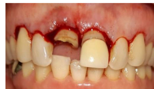
Figure 10. Internal bevel gingivectomy performed from maxillary right to left canine

Bard-Parker blade, internal beveled gingivectomy was performed along the bleeding points to get ideal contour and zenith on labial and palatal aspect of maxillary right to left canine (fig. 10).