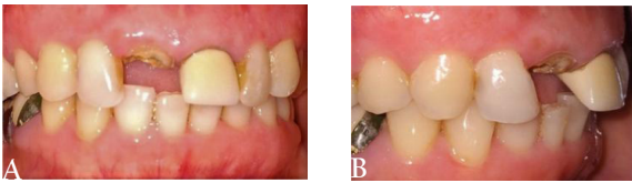
Figure 1. Initial clinical photograph of the patient A. front view B. lateral view

while smiling. Intra-oral examination showed that her 11 and 21 had been endodontically treated and there was inadequate clinical crown height in relation to 11 for crown placement. On periodontal examination, her oral hygiene status was good with healthy gingiva, no mobility, and sufficient width of keratinized gingiva (fig. 1). The intraoral periapical radiograph showed root canal therapy with respect to #11 and #21 and adequate crown to root ratio for lengthening (fig. 2).