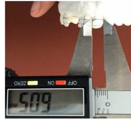
Figure 4. The tooth width measured at two reference points using digital caliper.

After giving local anesthesia, bone sounding was done around the tooth and we found that more than 3 mm of supracrestal soft tissue was present. The incision level was marked by placing bleeding spots with the tip of the probe as per the planning done in the cast (fig. 9). Using a no.15