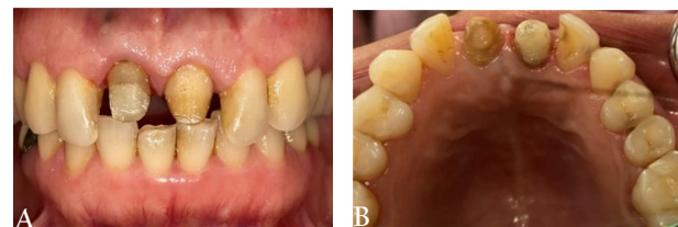
Figure 11. Post and core placed A. labial view B. palatal view

Immediately after surgery, a fiber post was placed and resin core build-up was done in relation to #11 and a fitting temporary crown was cemented with respect to #11 and #21 to guide the contour of the gingival tissues during healing (fig. 11A, 11B and 12). Final insertion of the porcelain fused metal crowns in relation to 11 and 21 was done 2 months after the crown lengthening surgery (fig. 13).