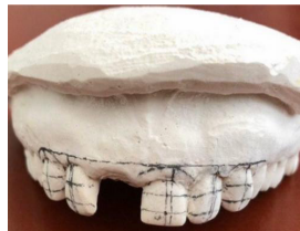
Figure 8. Final measurements for placing incision