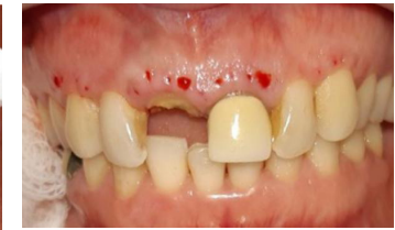
Figure 9. The level of incision marked by placing bleeding spots.

Bard-Parker blade, internal beveled gingivectomy was performed along the bleeding points to get ideal contour and zenith on labial and palatal aspect of maxillary right to left canine (fig. 10).