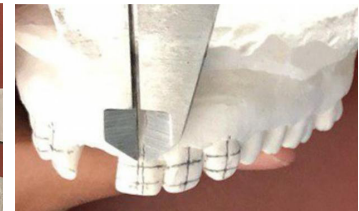
Figure 7. The mean location of the GZP from the VBM of the clinical crown marked.