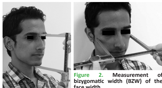
Figure 1. Measurement of naso-menton length (NML) of the face.

A total of 150 Nepalese medical students (52 males and 98 females) participated in this cross-sectional study using the criteria: (1) subject is Nepalese by birth, (2) age of the participants: 16-35 years, both male and female, (3) no gross asymmetry of the face, (4) no gingival or periodontal disease, (5) less than 0.5 mm spacing between anterior teeth, (6) minimal crowding as defined by the Little Irregularity Index (LII) 32 (1 to 3 mm of the linear displacement of the anterior tooth at five anterior contact points), (7) no intruded or extruded anterior teeth, (8) no anterior open bite, (9) no apparent loss of tooth structure due to attrition, fracture, or caries and (10) no anterior restoration. Study protocol and ethics were approved by the Institutional Review Committee of Kathmandu University School of Medical Science. All participants were requested to sign an informed consent document before participating.