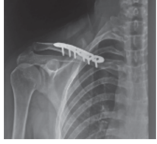
4. Figure Immediate post-operative image

Figure 5. United clavicle fracture (1 year follow-up)