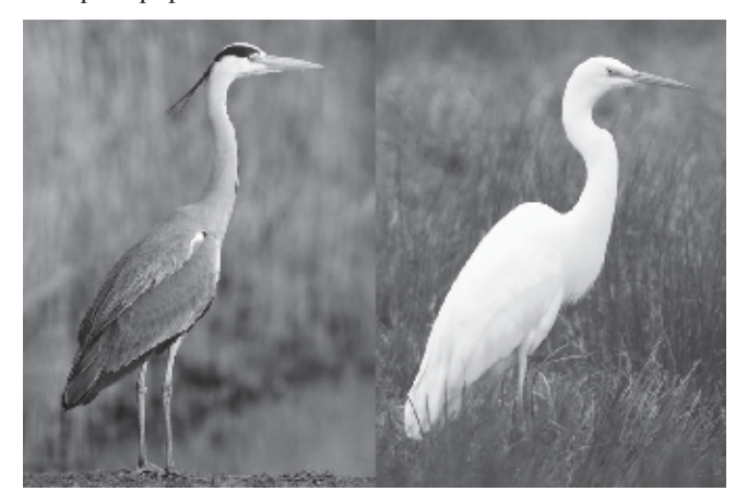
Fig 2. a) Herons and b) Egret birds<sup>7</sup>

Natural infections of Japanese encephalitis (JE) occur in Adreid birds (herons and egrets). Virus spreads from bird to bird through Culex tritaeniorhyncus mosquito. Culex vishnui, Culex gelidus, Culex whitmorei, Culex epidesmus act as next common vectors in India. Human infection occurs from these reservoir birds by several species of Culicine mosquitoes. JE virus cannot transmit from one person to another. JEV infection is more common in children below 15 years. Most adults in endemic countries have natural immunity after childhood infection, but persons of any age may be affected. In South-East Asia JEV transmission intensifies during the rainy season, during which mosquito population increases.<sup>7</sup>