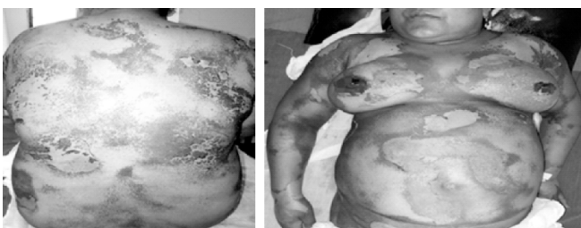
Fig5,6. Day 6: Granulation tissue as signs of healing after Doxycycline was stopped