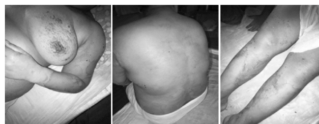
Fig7,8,9. Day 11, third day after discharge; signs of healing