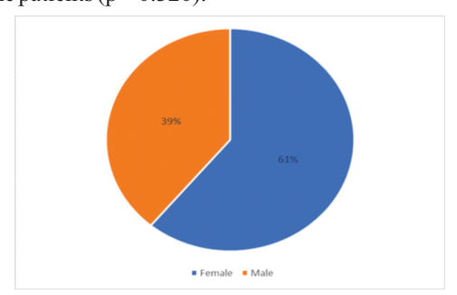
Figure I. Gender wise distribution of patient

Graft uptake success rates was 65 (84.4%) in 6 weeks and 64 (83.1%) in 6 months (table 1) and failure rates in 6 weeks and 6 months were 12 (15.6%) and 13 (16.9%) respectively. There was no statistical significance noted in graft success and failure rates after 6 weeks and 6 months post operative follow up of the patients (p = 0.320).