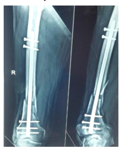
Fig 5. Three months follow-up