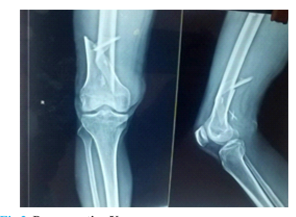
Fig 2. Preoperative X-ray

Patients were followed up at 6^{th} week, 12^{th} week and then at 6^{th} month. During each visit clinical and radiological union were assessed. The fracture was considered united only when there was formation of callus in any three of the four cortices assessed using the standard AP and lateral radiographs and when the patient was able to bear weight without any discomfort. Weight bearing was started depending upon the radiological union and consolidation at the fracture site. The functional outcome of fracture fixation was evaluated using Neer's scoring system.