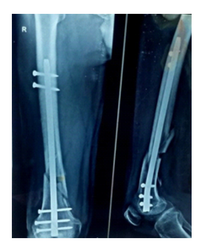
Fig 4. Six weeks follow-up

A STUDY OF FUNCTIONAL OUTCOME OF RETROGRADE INTRAMEDULLARY INTERLOCKING NAILING IN TREATMENT OF SUPRACONDYLAR FEMORAL FRACTURE Prakriti Raj Kandel, Bipan Shrestha, Kishor Man Shrestha, Pritam Chaudhary