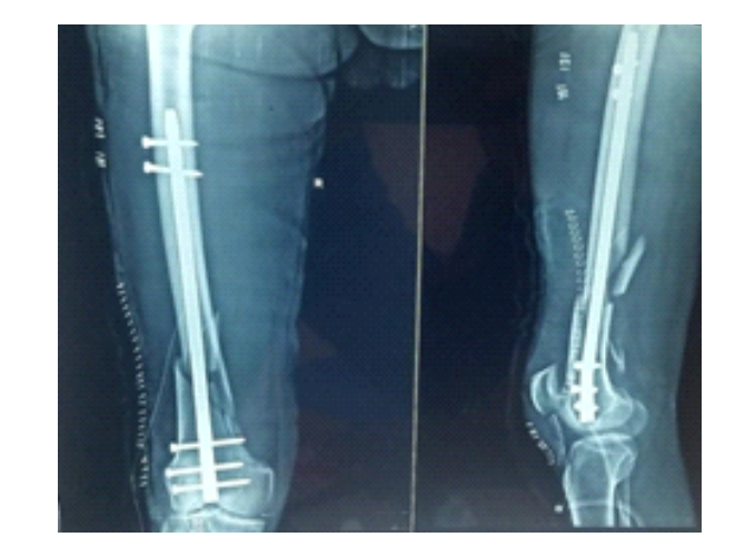
Fig 3. Postoperative X-ray