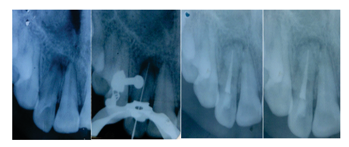
Fig 2. A) IOPAR wrt 22 revealing a periapical lesion and a radiolucent parapulpal line B) Working Length Determination wrt 22 C) Radiograph immediately after flaps were approximated D) Radiograph at 1 year follow up