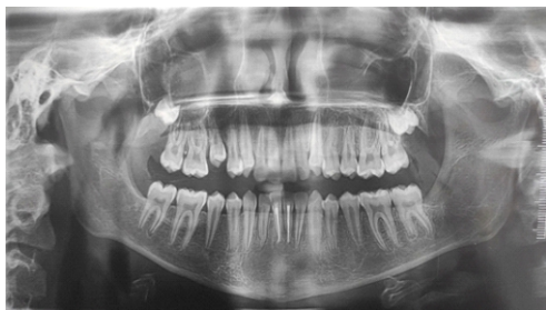
Figure 5. Post operative OPG after eight months of completion of treatment with healing cystic cavity