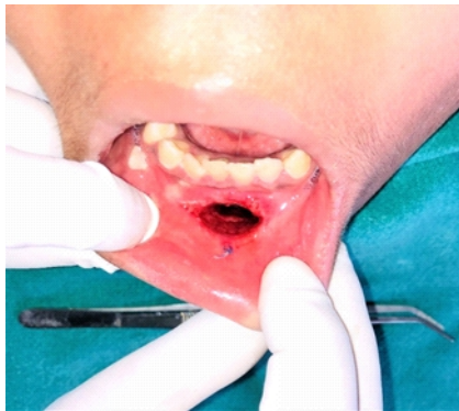
Figure 3. Marsupialization done under local anesthesia in the symphysis region