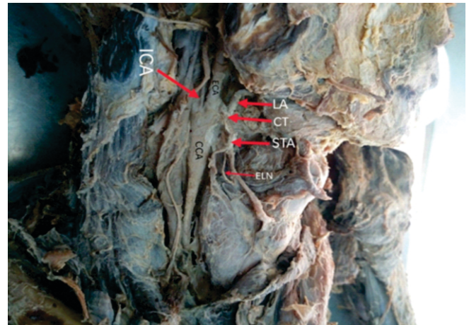
Figure 2. Showing the origin of STA by common trunk with lingual artery at right CCAB (0 mm from the CCAB) and external laryngeal nerve is posterior at the origin of STA and turning medially away from STA at 0.5 mm above the apex of thyroid lobe