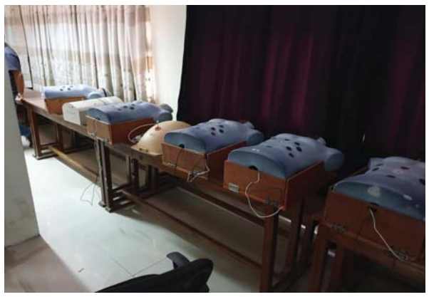
Figure 4. Nep- Endotrainer being used in Buddha MAI Portoscopic training program with other commercially available simulation box