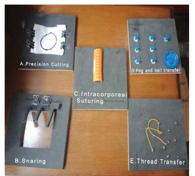
Figure 2. Interchangeable training modules for precision cutting (A), snaring (B), intracorporeal suturing (C), peg and ball transfer (D), and thread transfer (E)