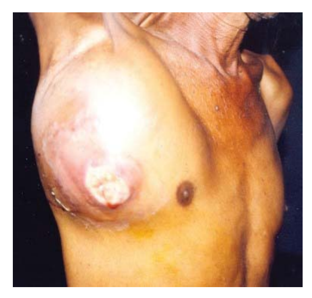
Figure 1. Ulcerated lump involving right breast and axilla