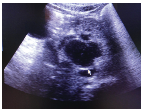
Figure 1: Ultrasound showing the complex cystic mass in pancreatic region

To summarize, pancreatic TB should be considered in the differential diagnosis of a pancreatic lesion, especially with atypical imaging appearance, for young people, in endemic areas and in immune compromised conditions. Such cases should be subjected to image guided FNA for pathological/ bacteriological diagnosis which may avoid a major surgery in favor of medical treatment to which the response is good.