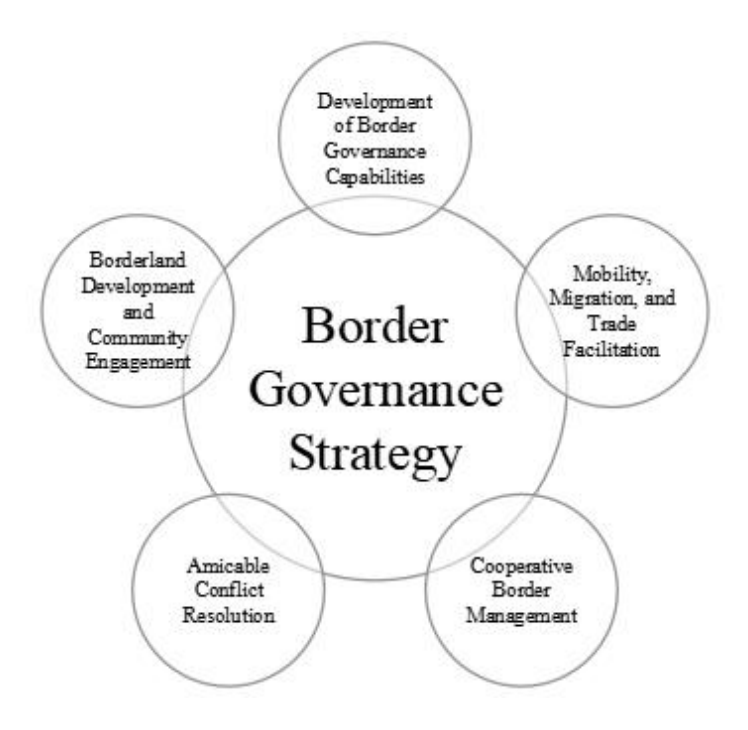
Figure 2 Border governance strategy for Nepal-India open border