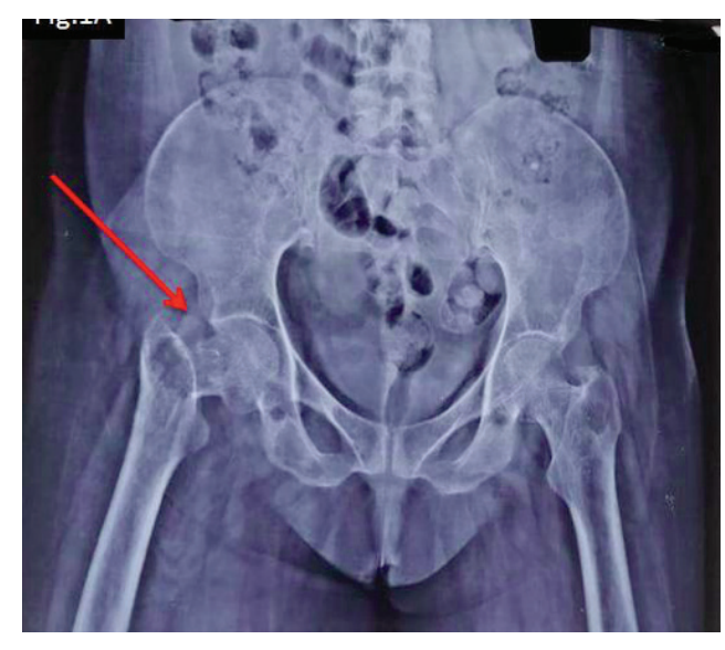
Figure 1:(a) Xray-Fracture neck of right femur

Here, we are describing a case of fracture of multiple bones in a female patient for which, after extensive investigations, the cause was detected as a parathyroid adenoma.