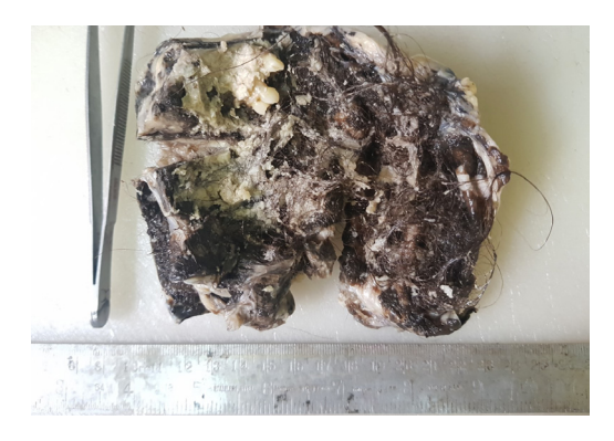
Figure 1: Gross photograph of ovary showing solid dark black walls and cystic areas filled with cheesy material, hair follicles and few teeth.