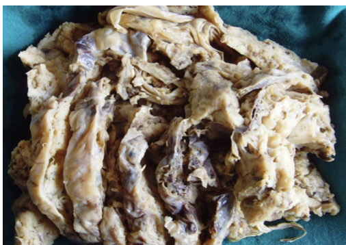
Figure 1: Macroscopic appearance of Tumor

space. USG showed hemorrhagic collection in lesser sac. Patient was operated under general anaesthesia. Tumour was resected and sent to department of pathology.