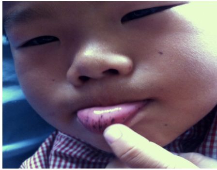
Figure 1: Mucocutaneous pigmentation in the lower lip.