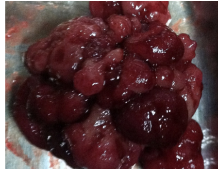
Figure 2: Multiple polyps of different sizes and shapes seen

exhibited arborization of muscularis mucosae covered with normal villi and was defined as a hamartoma, thus confirming the clinical diagnosis of Peutz-Jeghers Syndrome (fig. 3).