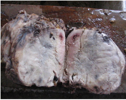
Figure1: Gross picture showing the tumour about 8×5×4 cm, well-circumscribed, nodular mass