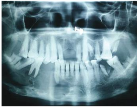
Figure 1: OPG showing multilocular radiolucency extending from midline to right ramus of mandible.