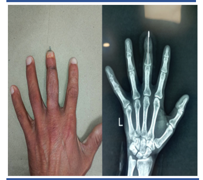
Figure 2. Bone graft and K-wire in situ at 3 months postoperative