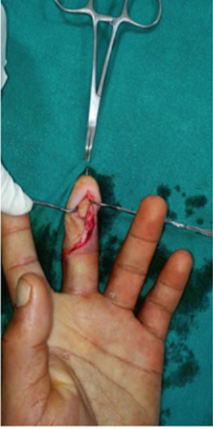
Figure 1. X.ray depicting osteomyelitis of middle phalanx and DIP joint of the left long finger, debridement and replacement of bone cement