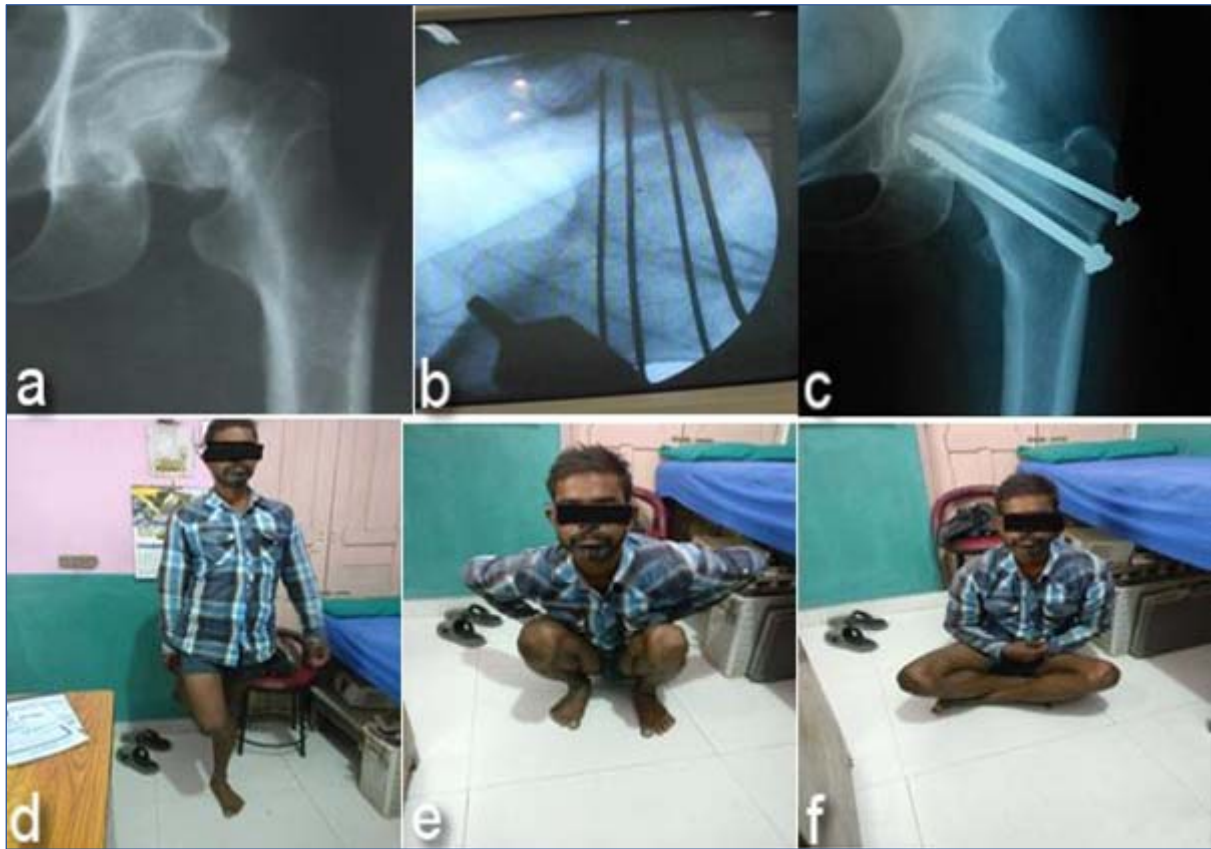
Figure 1. Fracture neck of femur (a), Superior most K-wire and three guide wires (b), Post-operative X-ray (c), Follow up at thirty months- standing on operated leg (d), Squatting (e), Sitting crossed leg (f).

Delay of operation from time of injury was 4.8 weeks (range 3-14), time of union 21.6 weeks (range 14-48) and average follow up 39.4 months (range 22-80 months).