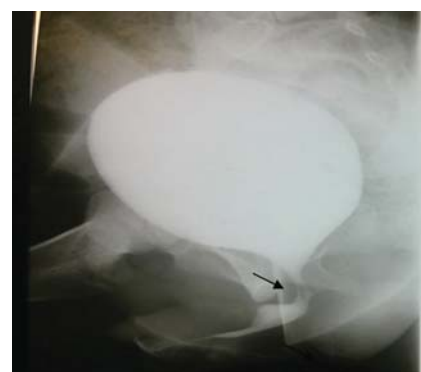
Fig 1: Photograph, MCU showing posterior urethral diverticulum.

urine volume (Figure 1). Cystourethroscopy revealed a diverticulum in the region of posterior urethra distal to verumontanum. Intra venous urography showed both kidneys normal without any dilatation of upper tract. Diverticulum was approached through midline perineal incision. Cystoscope was advanced to locate extent of lesion thereby facilitating dissection. Dorsally placed diverticulum was rotated ventrally by hooking it with infant feeding tube. Diverticulectomy and urethroplasty was done over the infant feeding tube with the help of vicryl 5-0 suture along with reinforcement of corpus spongiosum (Figure 2). Post operatively patient was voiding with good urinary stream with insignificant post void residual urine. In one year follow up in outpatient department the patient was asymptomatic.