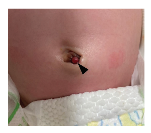
Figure 1: The umbilical granuloma before removal. Physical examination revealed a small, moist, and dull red - colored mass protruding from the umbilicus (arrowhead).

Gentamicin ointment was applied to the inflammatory lesion after cleaning with chlorhexidine gluconate. After confirming that the seropurulent secretion had disappeared on the following day, we performed granuloma removal using a 2 - 0 nylon suture thread. First, the base of the umbilical granuloma was gently ligated with the thread. Next, the umbilical granuloma was cut off by tightening the thread (Figure 2). Although a small amount of bleeding occurred, it disappeared immediately upon providing manual astriction. Finally, we cleaned the umbilicus with chlorhexidine gluconate and applied gentamicin ointment again.