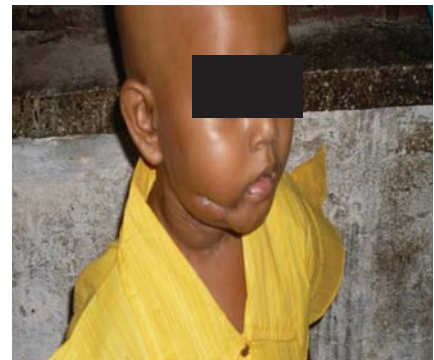
Fig 3: Patient after 4 th cycle of chemotherapy.

from the intraoral part. Patient underwent tracheostomy followed by bilateral external carotid artery ligation and punch biopsy from the intraoral part of the lesion. Ryle's tube was inserted for enteral feeding.