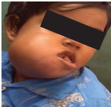
Fig 1: Patient at the time of presentation.