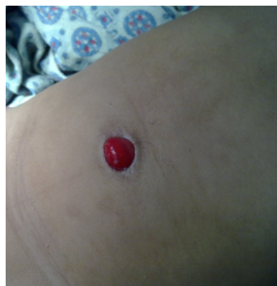
Figure 1. Umbilical mass

Patent VID is a result of complete failure of obliteration of this duct. The duct may remain patent throughout its course, producing an enterocutaneous fistula between the distal small intestine and the umbilicus. It is the rarest form among VID anomalies seen either in neonates or in infants with the incidence of 0.0063–0.067%. 3 Exact etiology of incomplete obliteration is unknown. Different teratogenic models are