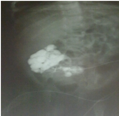
Figure 2. Fistulogram showing connection to small bowel

presented in the literature however none can accurately address a direct cause or effect relationship with these anomalies. In our patient, there was no history to explain such etiology. 4