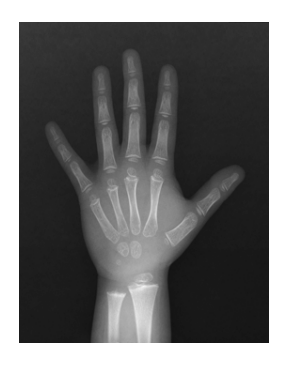
Figure 1. Frontal radiograph of wrist and hand showing visualisation of three carpal bones corresponding to bone age of around four years

A seven and half years old girl child presented with menstrual bleeding, four to five days in a month, since last two months. She also complained of abdominal pain during the episodes. Mother also gave history of recent weight gain which was not quantified. The child was developmentally normal with good scholastic performance and no significant past history except for poor height gain. She was a first born child of a third degree consanguineous marriage. At presentation her anthropometric measurements on WHO 2007 reference charts were as follows: height- 97.5 cm (< 3<sup>rd</sup> centile), weight- 17.8 kg (between 3<sup>rd</sup> to 15<sup>th</sup> centile) and head circumference- 48.5 cm (< -2SD). The mid parental height was 150.75 cm. The upper segment to lower segment ratio was 1.05:1, suggestive of proportionate short stature. Her