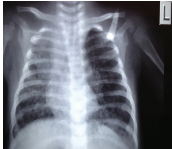
Fig 2: Chest X-ray showing improvement in one week treatment