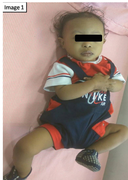
Fig 1: Showing patient with flat facial profile, depressed nasal bridge, upward slant of palpebral fissures, low set ears, short and broad hands and fingers

The phenotypic expression in DS is determined by the type of underlying cytogenetic abnormality. Those with mosaicism tend to have less typical characteristic features and also to function at a higher intellectual level compared to those with complete trisomy 21 5 . Prasher found that DS patients with translocation had less severe learning disability, less obesity and increased frequency of psychiatric disorders; however, they had significantly