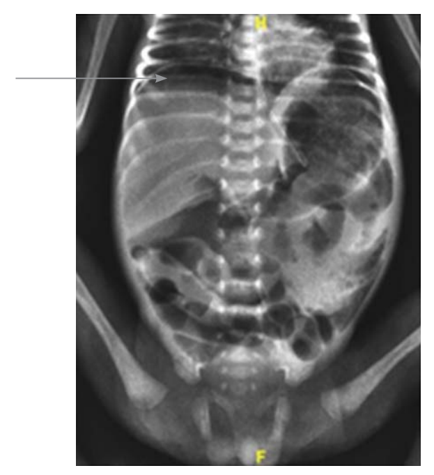
Fig 1: X-ray abdomen showing pneumoperitoneum

Histopathology of resected segments revealed extensive ulceration of bowel with serositis. Broad fungal elements were seen with angio-invasion at places. Features were consistent with gastrointestinal mucormycosis (Figure 2 and 3).