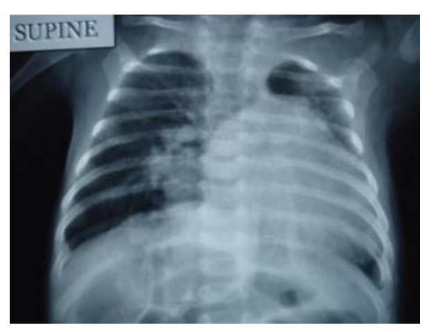
Fig 1: Showing complete opacification of ieft hemithorax with hyperinflation of right lung.

consolidation of bilateral lower lobes (Fig-2). She was managed conservatively in our centre and was discharged. After which she is on regular follow up and doing well.