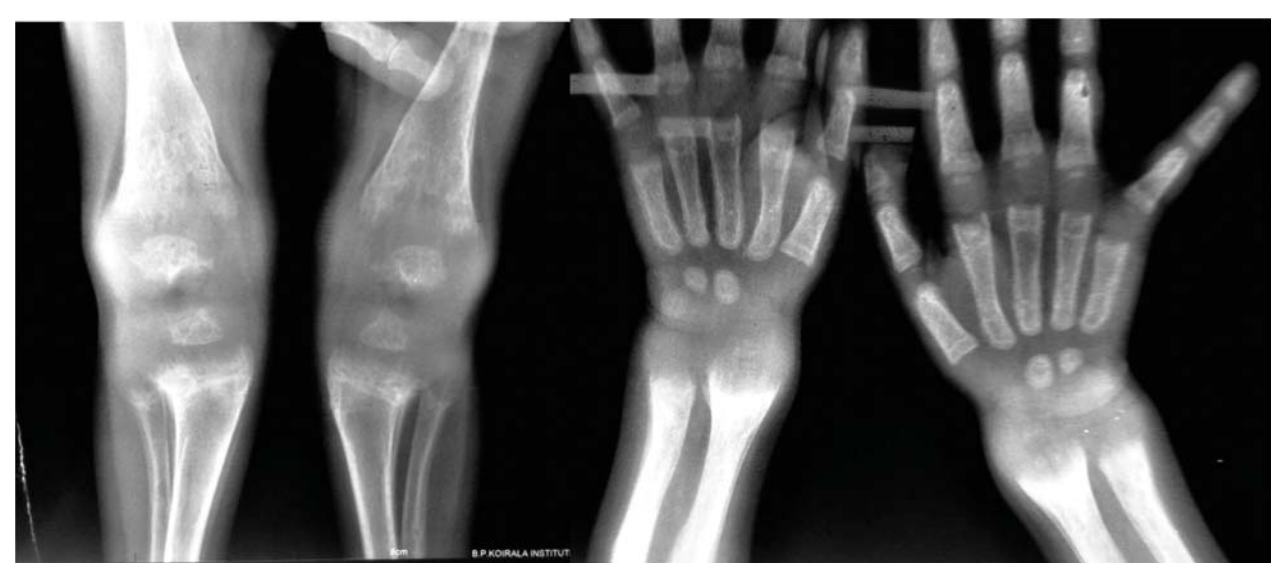
Fig 2: X-ray showing metaphyseal widening, cupping, fraying and splaying.