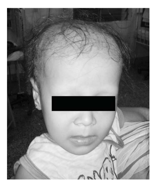
Fig 3: Hair growth over scalp after Vitamin D_3 and Calcium therapy