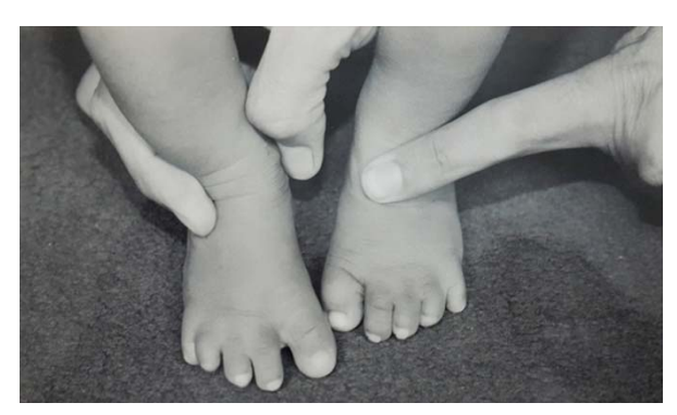
Fig 2: Showing hypoplasia of toes in both feet