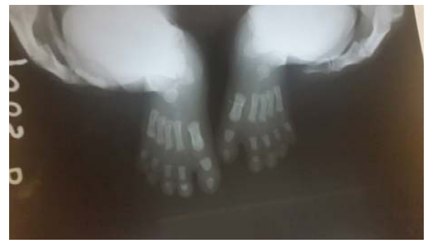
Fig 3: X-ray feet showing hypoplastic phalanges and absent distal phalanges in little toes

Adams Oliver syndrome (ACC type II) is characterized by distal limb reduction anomalies in association with the absence of skin. It is most commonly transmitted as an autosomal dominant trait with variable penetrance and expression, but autosomal recessive (AR) mode of inheritance and sporadic cases are also reported<sup>4</sup>. There are no differences in clinical manifestations based on the mode of inheritance. In our case, there was no family history of AOS, so it is most likely a sporadic one.