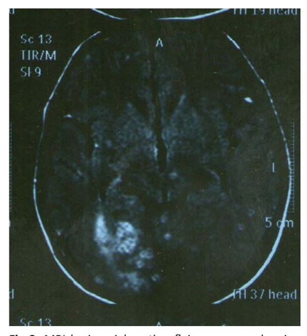
Fig 2: MRI brain axial section flair sequence showing scattered hyperintensities.