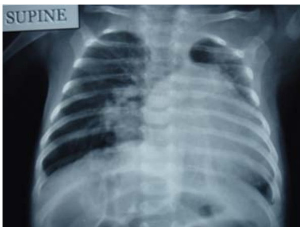
Fig 1: Showing complete opacification of left hemithorax with hyperinflation of right lung.

consolidation of bilateral lower lobes (Fig-2). She was managed conservatively in our centre and was discharged. After which she is on regular follow up and doing well.