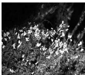
2. Arcyria cinerea