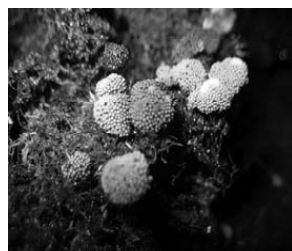
6. Tubifera microsperma