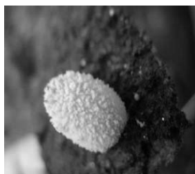
1. Fuligo cinerea