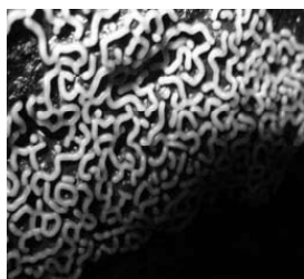
5. Didymium flexuosum