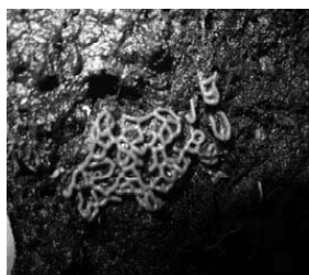
4. Hemitrichia serpula