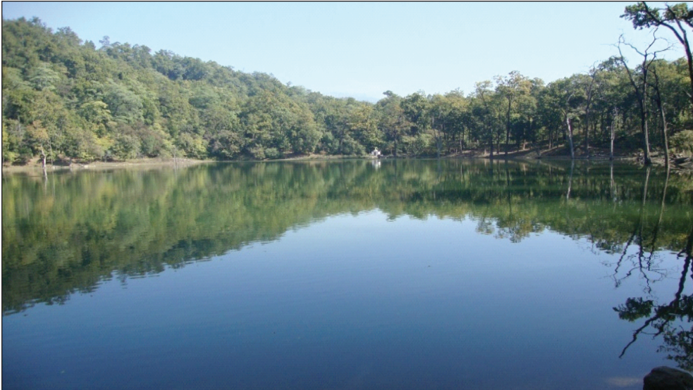
FIG. 1b. Betkotlake, Daijee-5, Kanchanpur, Nepal (MAP: KARNA, Y K).