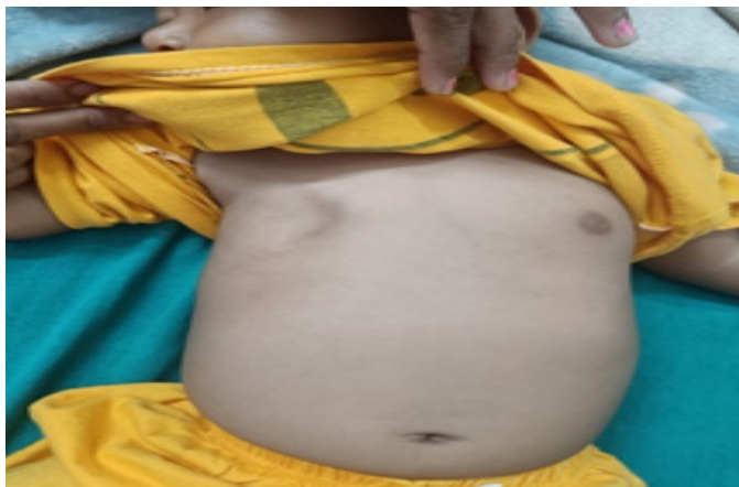
Figure 1: Anterior chest wall

muscle was confirmed. The CT scan revealed that the pectoralis major, minor, and serratus anterior on the right side were completely invisible. The pectoralis major, minor, and serratus anterior muscles on the left side of the thoracic spine were all normal. We present a case of Poland syndrome in an infant female, emphasizing the fact that Poland syndrome can manifest without classic hand deformity.