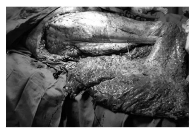
Figure 2: Degloved flap turned inside out

Twenty nine year old man fell off the scooter he was riding. He landed on his right thigh and ripped off most of the thigh skin (Figure 2). He presented to Madhyapur Hospital immediately after the accident. He did not have any other injury except diastasis of the symphysis pubis. He was taken to operation theater within few hours. His wound was thoroughly washed. Split skin graft was harvested from the degloved skin before excising it and applied to the defect in the same setting. Pubic diastasis was fixed after two weeks. He fully recovered and went home in one month's time (Figure 3).