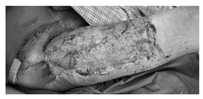
Figure 3: Grafted area after two weeks