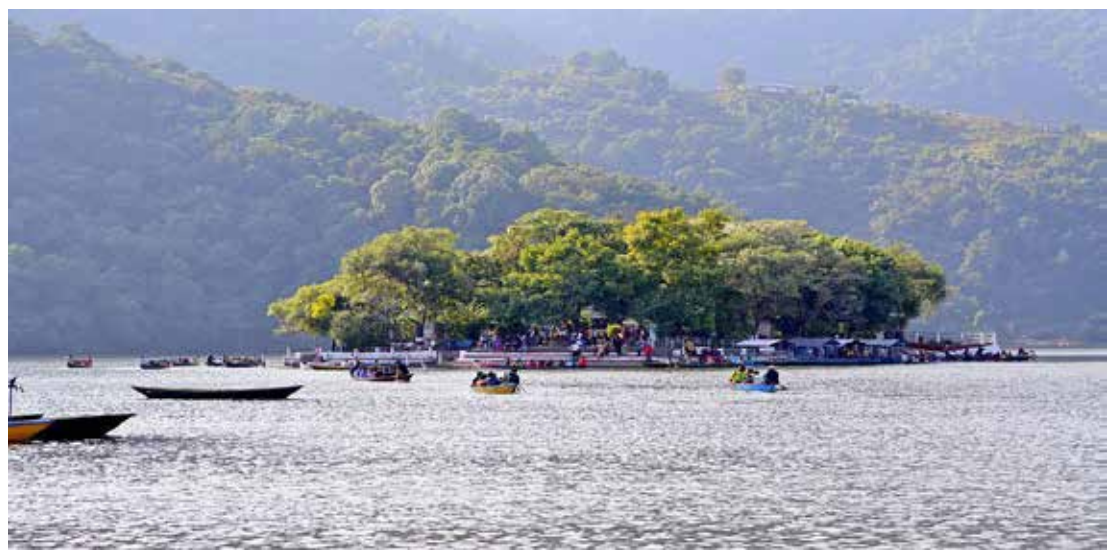
Figure 1: Geographical view of Phewa Lake