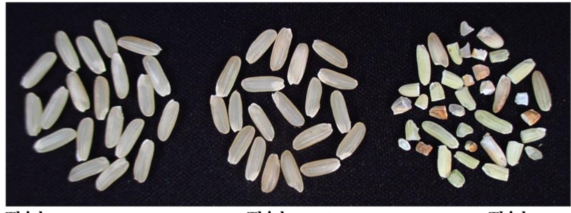
Thickness \geq 1.7 mm 1.7 mm > Thickness \geq 1.5 mm 1.5 mm > Thickness

ECOLONG<sup>®</sup> 424-100 type, ECOLONG<sup>®</sup> 424-140 type and ECOLONG<sup>®</sup> 413-180 type: see text.