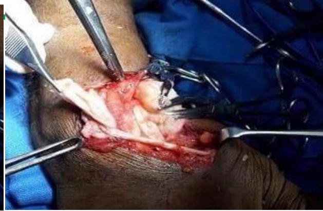
Pic 2. Involvement of EPL, ECRL and ECRB