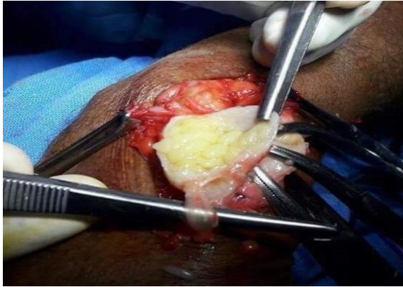
Pic1: Thickened tendon sheath with melon seed and rice body