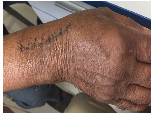
Pic 4. Healed scar at 2 weeks

Volar slab extending to thumb was given for 3 weeks as hook of EPL at listers tubercle had to be augmented due to enlargement and degeneration of the compartment sheath from inflammatory tissue. Histopathology showed epithelial granuloma with minimal caseous necrosis and Langhans giant cells. Biopsy tissue was positive for AFB stain. Antitubercular drugs were started and patient became normal in 2 months with full range of motion of wrist. After nine months of completion of ATT, the disease healed in terms of wrist and pulmonary lesions with no relapse at three year follow up.