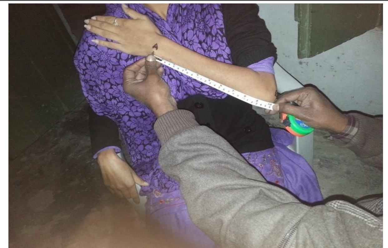
Fig-1: Figure showing the measurement of ulna length in adult female participant. Tip of the olecranon process is marked as B and the ulna styloid process is marked A. The length A<sup>[]</sup>B demarcates the ulna length.