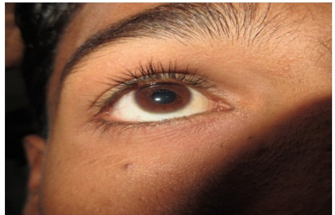
Fig.3. Complete removal of lice and nits.

Phthiriasis palpebrarum is an uncommon cause for pruritus still seen in developing countries with poor personal hygiene. Phthiriasis palpebrarum is characterized by infestation of eyelashes with Pthirus pubis also considered as a sexually transmitted disease (STD).[5] The primary habitat of Phthiriasis pubis is pubic hair but in severe infestations, the hair of axilla, chest, eyebrow and eyelashes are also involved.[1,6,7,8] Phthiriasis