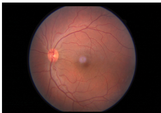
Fig. 2. Normal fundus of the left eye

Intraocular pressure were 22 mmHg and 16 mmHg in the right and left eyes respectively. Ocular findings were suggestive of CRAO of the right eye. Ocular massage for 15-20 minutes was done and oral carbonic anhydrase inhibitor 250 mg four times for a day was given as for the conservative management.