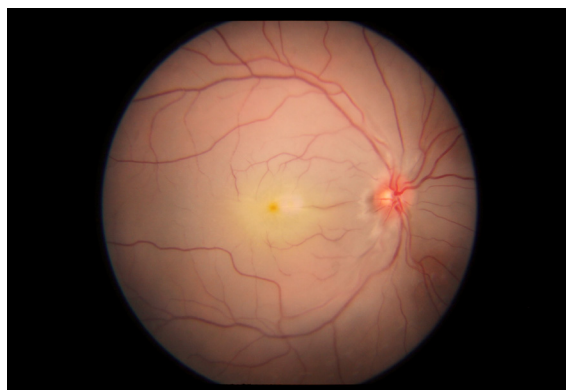
Fig. 1. Pale retina with cherry red spot on right fundus

A 32 years female presented to the emergency department with the chief complaint of sudden and painless loss of vision in her right eye for one day. She had no significant medical and surgical history. She did not give any history of trauma or other precipitating events and was not under any regular medication. On examination, her best corrected visual acuity was perception of light (LP) and 6/6 in right eye and left eye respectively. On slit lamp bio-microscopic examination, anterior segment of both eyes were normal except relative afferent pupillary defect was positive in right eye. Right fundus showed pale retina and cherry red spot whereas left fundus was found to be unremarkable on posterior segment examination (Fig.1 and Fig.2).